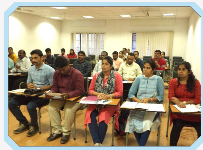
Participants of DCJ & FS Programme