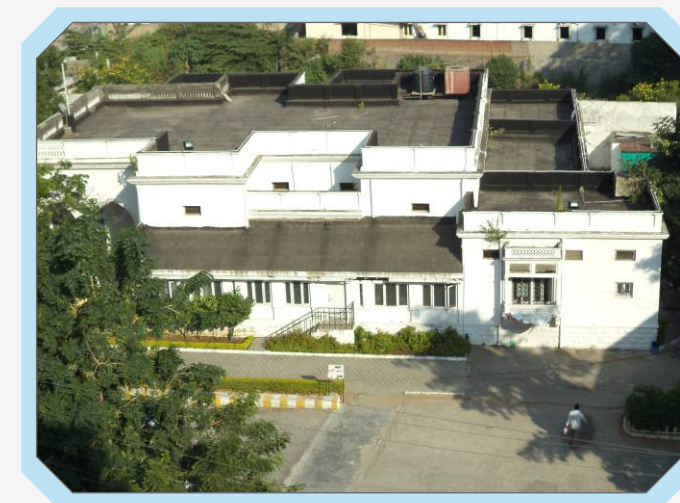
Aerial View of CDVL GT Campus, Abids