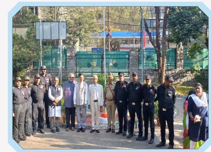
Pro Vice-Chancellor at Independence Day 2023 Celebrations at CDVL GT Campus, Abids