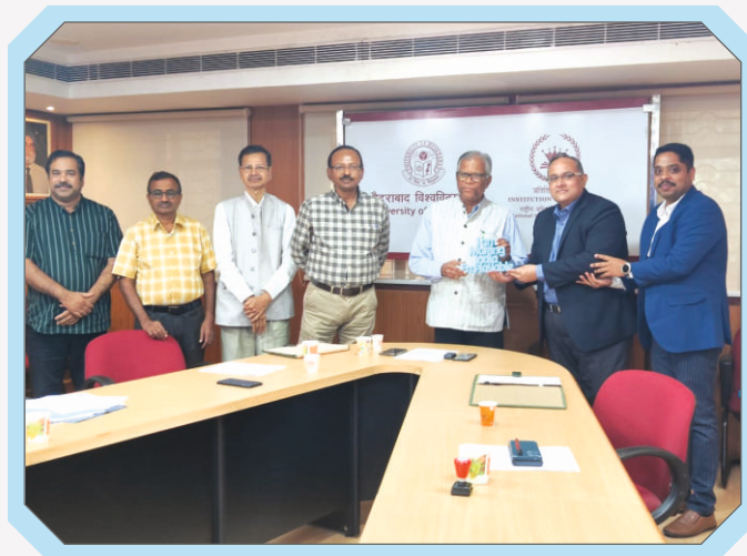
MoU signing with Team Lease in the presence of UoH Vice-Chancellor and Registrar