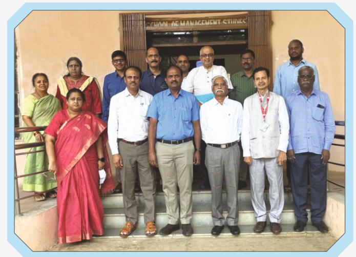
64th Co-ordinators Committee Meeting