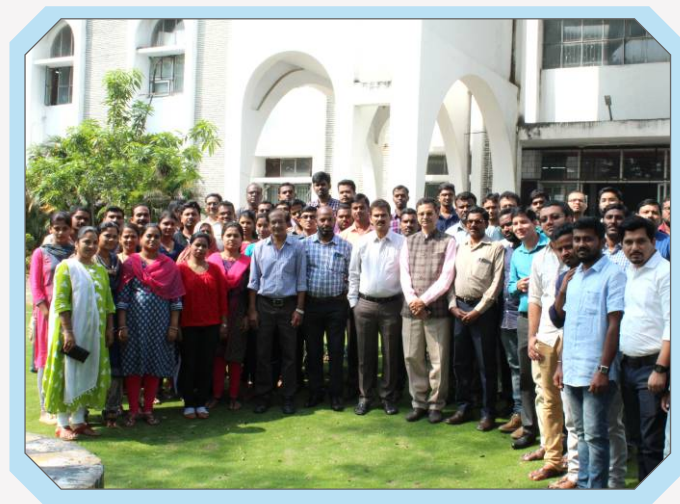
Participants of DLAN Programme