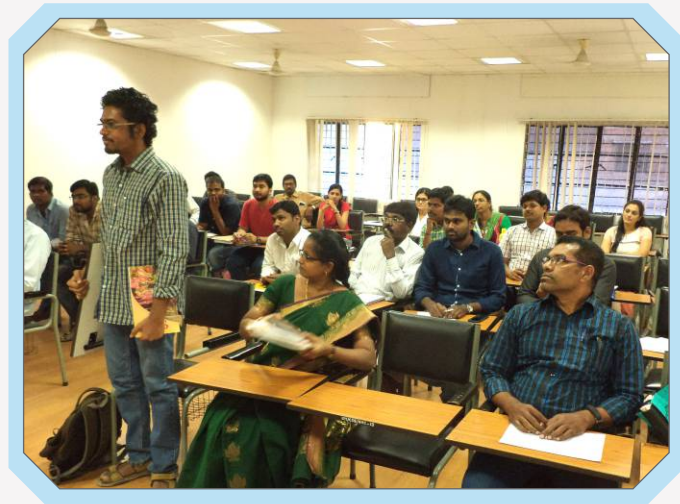
Participants of DCE Programme