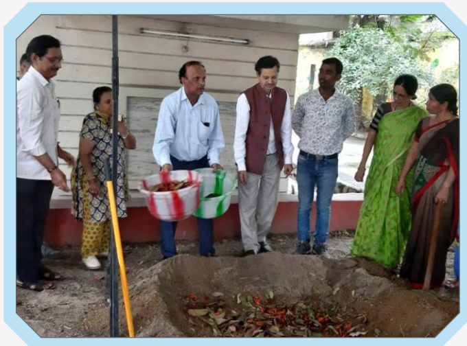
Bio compost activity with GHMC at GT Campus, Abids