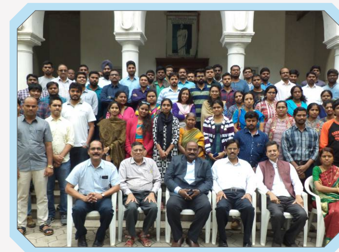
Participants of DCL & IPR Programme