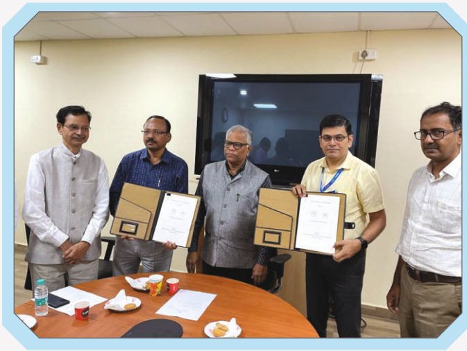
Vice-Chancellor - UoH, while exchange of MoU with NIRD